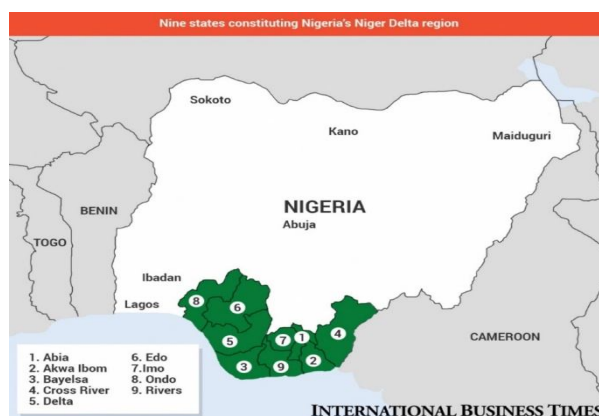
Map 1.2 Map indicating the Niger Delta Region

The Niger Delta region is a region in the South South of Nigeria which is situated along the Niger River near the Atlantic Ocean. The Niger Delta region, which is a massive region with a lot of states inside it, is one of the largest delta areas in the world. It is rich in the flora and fauna and account for about 90% of Nigeria's crude oil, which produces most of the oil of the country. The area has also been marred with series of violence as the inhabitants of the region fought the government in protest of their suppression on the issue of the oil considering that their region is still underdeveloped, however, the government benefits from the oil at the expense of those Niger Delta inhabitants. The government of Nigeria actually calls those fighters insurgency militants. However, in the region, those fighters are deemed as heroes and freedom fighters as they fight against repression of their land and their kith and kin. The map 2 below by Laccino (2015: 1) shows the Niger Delta map. The states in the dark shade on the map are the states constituting the Niger Delta region in the South, South area of Nigeria.